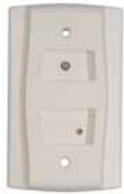
RTS151 UL S4011

System Sensor provides system flexibility with a variety of accessories, including two remote test stations and several different means of visible and audible system annunciation. As with our duct smoke detectors, all duct smoke detector accessories are UL listed.