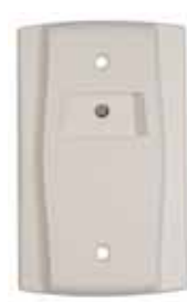
RA100Z UL S2522