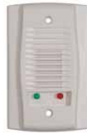
APA151 UL S4011