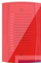
MHR UL S4011