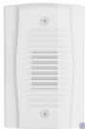
MHW UL S4011