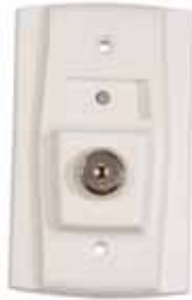
RTS151KEY UL S2522